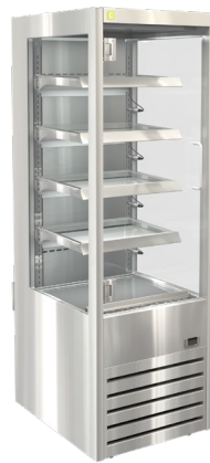
Shown with optional frameless hinged acrylic front door sold as accessory kit