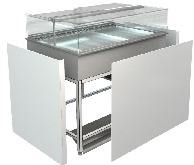
White gloss powder coated zintec panels with stainless base trim available as an optional extra