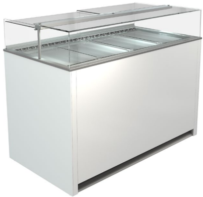
Shown with panel option