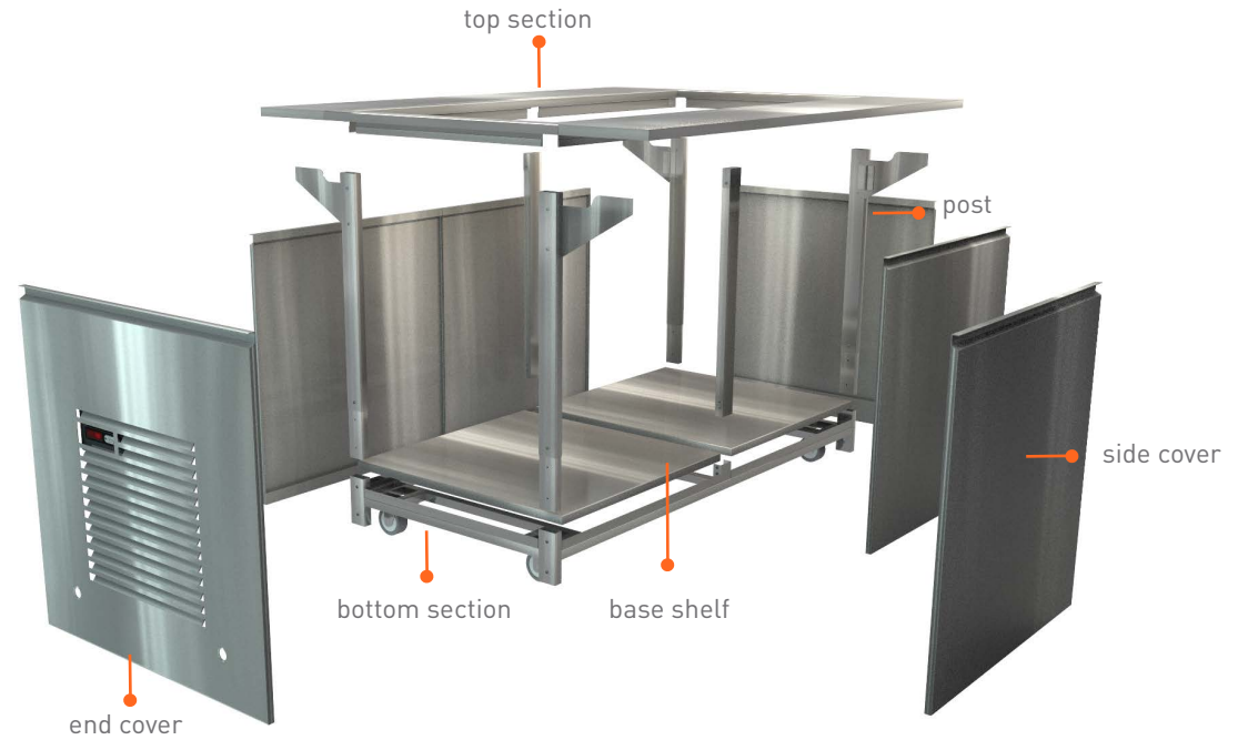
EXPLODED TROLLEY DIAGRAM