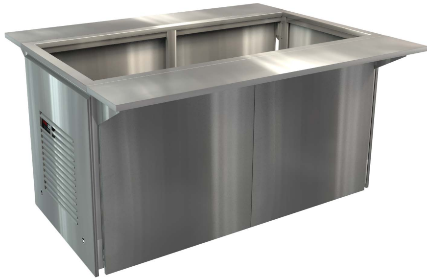
LSMT GANTRY ASSEMBLED